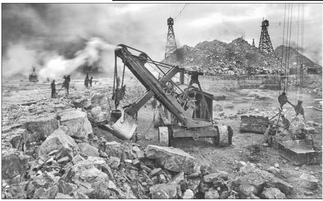
A STEAM SHOVEL removes rock loosened by dynamite in the Livingstone Channel, circa 1910. The Detroit River had been dewatered to allow for the massive project to deepen and widen the river.

With the dams constructed, the work of dewatering the central area of the site, encompass-