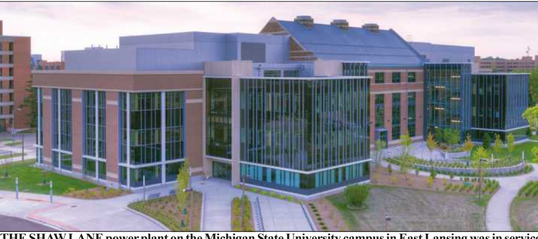
THE SHAW LANE power plant on the Michigan State University campus in East Lansing was in service from 1947 to 1975. Over the past few years, Granger Construction and its building trades union workforce converted the building, built additions, and created classroom and laboratory space. Over the past several months the building's design has won two awards for its creative use of mass timber.

Get well wishes are extended to all our Brothers and Sisters who are on our sick list. Be Safe and Be Healthy!