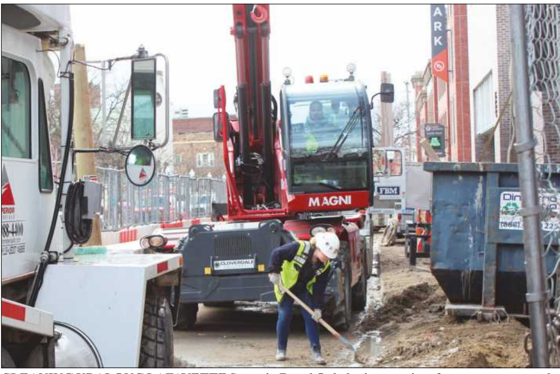
CLEANING UPALONG LAFAYETTE Street in Royal Oak during a series of concrete pours at the Baker College project is Laborer Kylie Ticconi of Local 1076. She's employed by Colasanti.

College's online campus offers more than 40 academic program options for students globally.