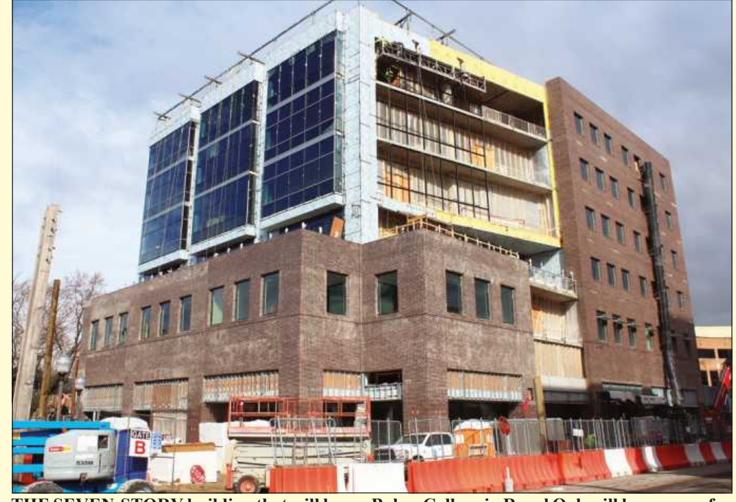
THE SEVEN-STORY building that will house Baker College in Royal Oak will have space for 1,500 students, adding significant vitality to the city's downtown. Colasanti Construction Services