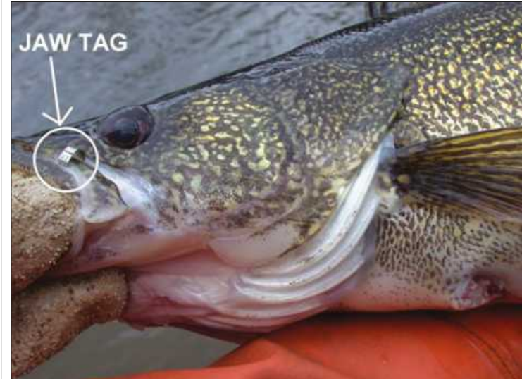
JAW TAGGED walleye are sought by the DNR.

A second study will take place in Saginaw Bay this year in which 150 walleye will be implanted with acoustic transmitters that allow researchers to track the fish and learn more about their movement. Those walleye will have belly tags and will also include a $100 reward for the return of the transmitter.