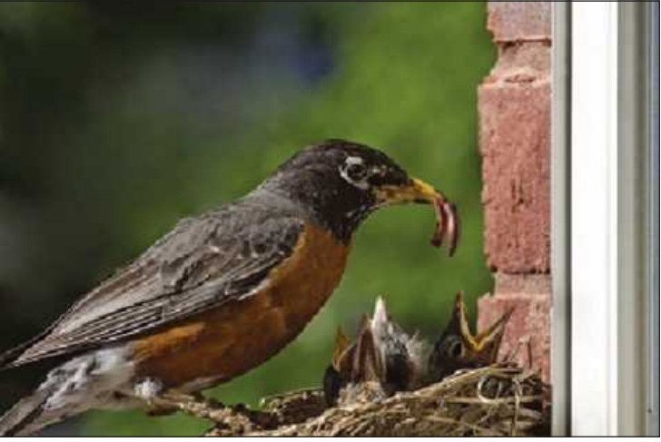
ROBIN MAMAS know what's best for their chicks - leave the babies alone if you find them without adult supervision.

No matter where you find them, never remove animals from the wild. Young animals rarely are abandoned and their best chance for survival is to remain in the wild. (From the Michigan DNR)