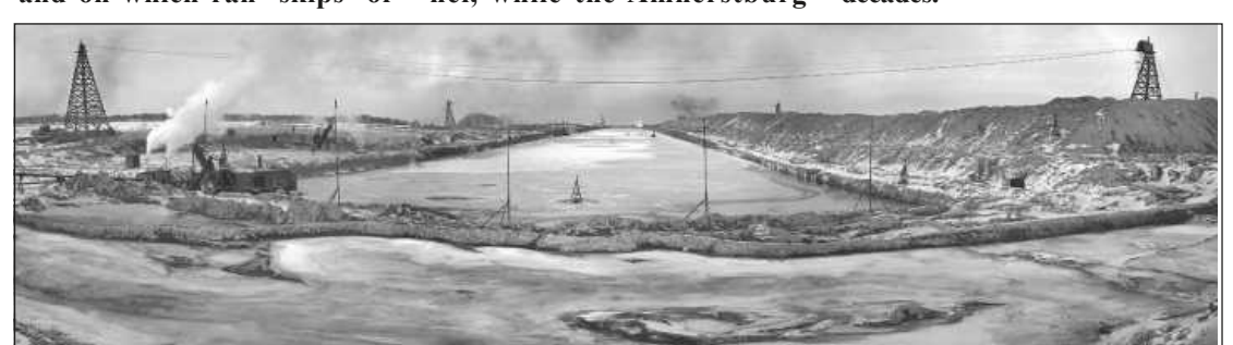
EXCAVATION of the Livingstone Channel in the Detroit River, 1910.

The Livingstone Channel underwent additional deepening and widening projects in future decades