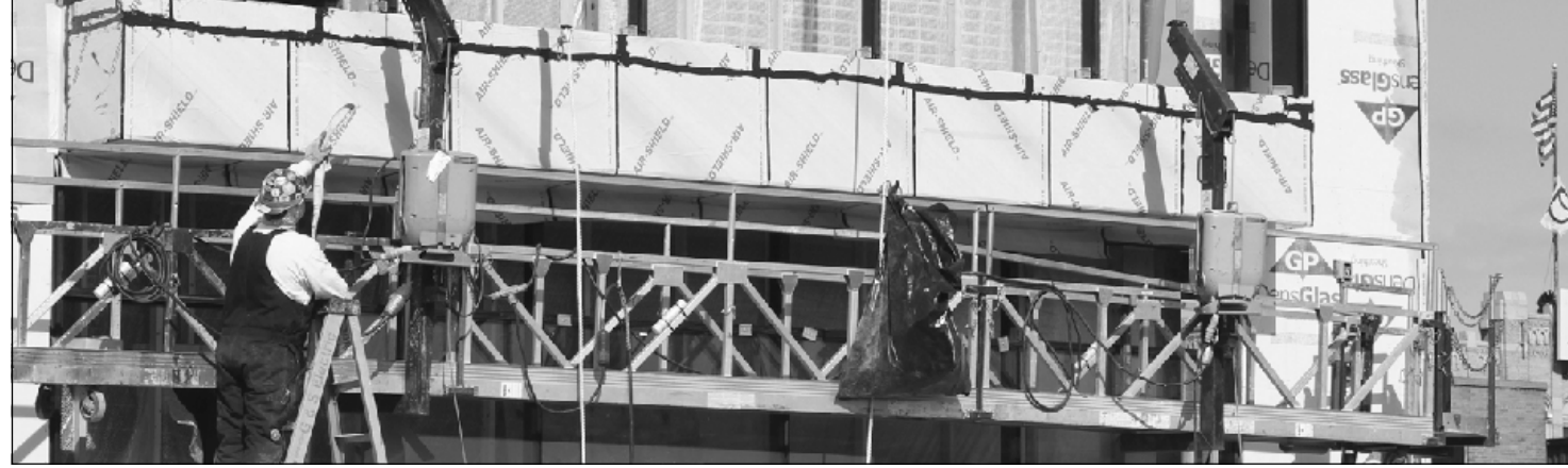
CONSTRUCTION OF THE NEW Baker College campus in Royal Oak will yield a seven-story building featuring flexible and connected classrooms, laboratories and interactive spaces for students and staff. Construction is proceeding under the management of Colasanti.

Out of work list: Please remember to call extension 17 when you are laid off. You must call line 17 to be put on the available to work list. When you leave a mes-