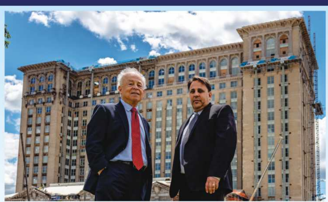
THERE IS NO FEE UNLESS YOU RECOVER DAMAGES!